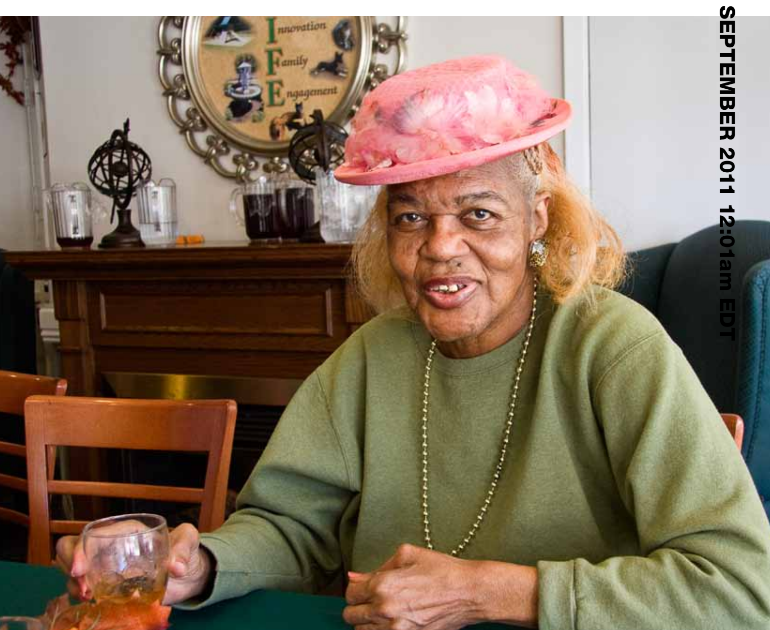
Six women at this Silverado Senior Living residential Alzheimer's community in Texas, USA, were taken by staff members to a flea market to select and purchase a hat. The next day a special table was set for them in the dining room. Each woman arrived, sporting her new hat or was helped to put it on. They all had a good time.

The effectiveness of health systems in identifying people with dementia depends upon the potential consumers, as well as the providers of health and social care. Encouraging help-seeking by raising awareness of dementia is an essential component of any comprehensive strategy to close the treatment gap. However, increased demand needs to be met by adequately prepared and resourced services, trained and able to make accurate diagnoses in a timely and efficient manner, and to ensure that the diagnosis leads seamlessly to the provision of evidence-based care. While acknowledging the importance of promoting demand for services, the focus for this chapter is upon service responses.